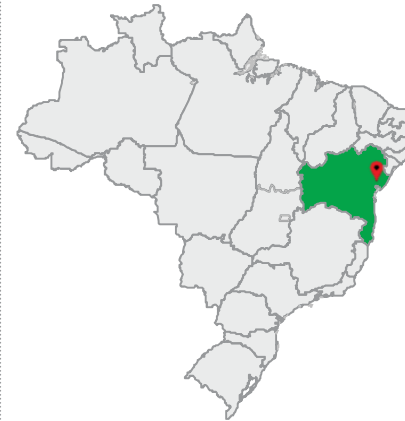
São Francisco do Conde