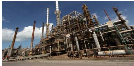
RLAM – Refinaria Landulpho Alves